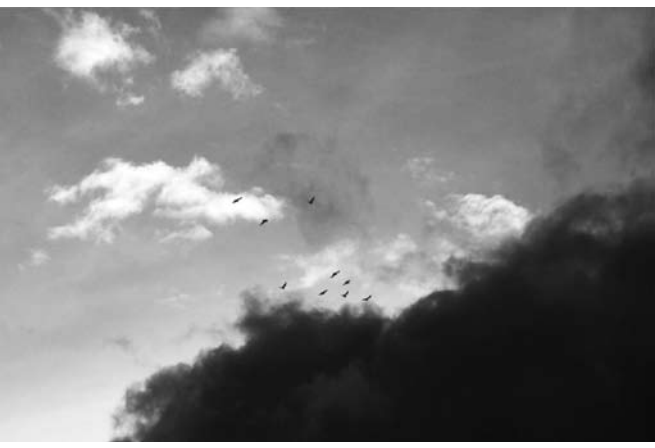
Recovery Through the Lens

'Getting Serious about Stigma: The problem with stigmatising drug users', published by the UK Drug Policy Commission in December 2010,